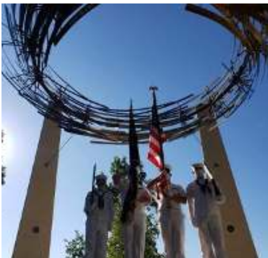
Sea Cadets at the Wreath of Honor

Our primary goal is to recruit new members. We have not been allowed to enter schools to promote our program due to COVID-19, but we hope to in-