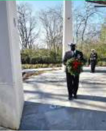
The Navy was there at the Fallen Five

Individually, Navy Leaguers were among the contributors to the fund that financed the purchase of the wreaths. Following the ceremony, a smaller group met at the Wreath of Honor Memorial at the Riverpark adjacent to the Tennessee River to present wreaths in honor of the "Fallen Five". NOSC Chattanooga personnel were present to lay a Wreath on each pillar.